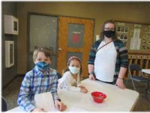
Early arrivals with children could do cleverly planned Easter arts and crafts