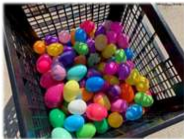
Thank you to all who donated candy to fill the many Easter eggs that were hid