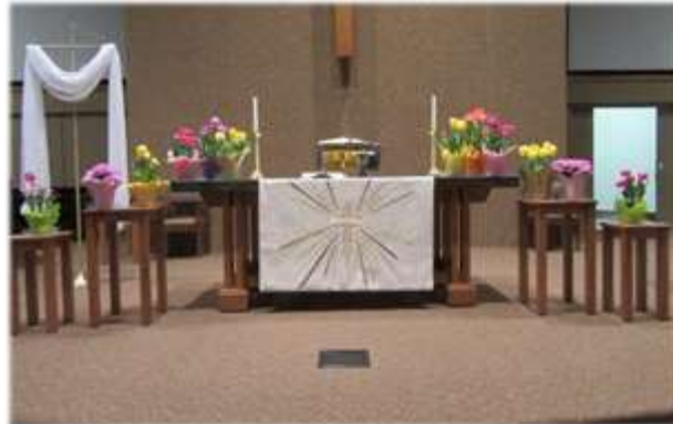
The altar was adorned to represent the beauty of Easter